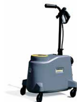
PS 4/7 BP OBC MISTER